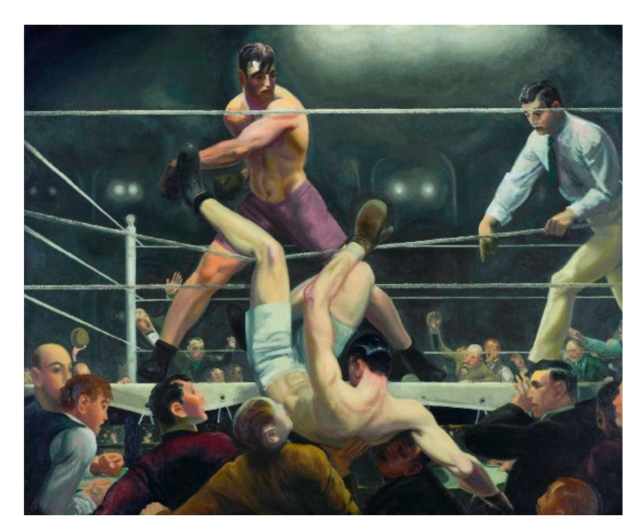
13. George Bellows, Dempsey and Fripo , 1924, Whitney Museum of American Art, http://collection.whitney.org/object/214