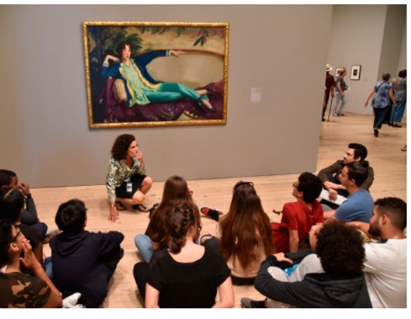
12. Museum class in front of the portrait of Gertrude Vanderbilt Whitney