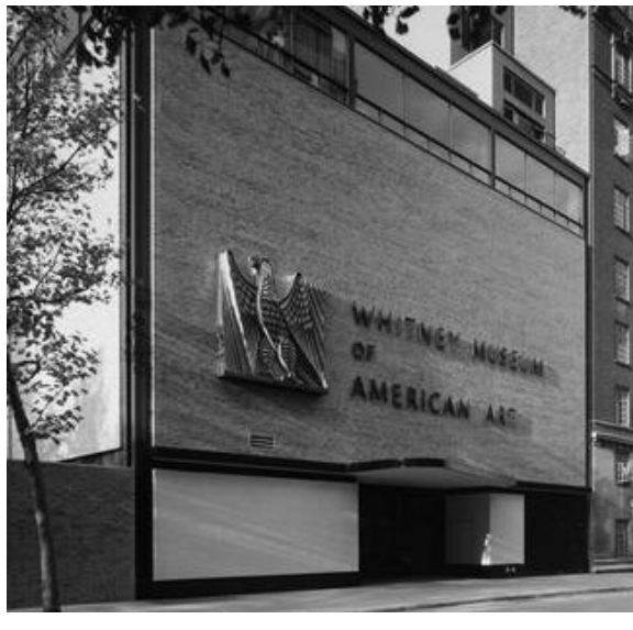
4. Second building of the Whitney Museum, West 54<sup>th</sup> Street, http://designobserver.com/media/images/whitney2a.JPG

the street by a moat and reached by a concrete footbridge comparable to a drawbridge. The intention inspiring the architect was most probably to separate the art museum from street commerce and the clamour of the big city.