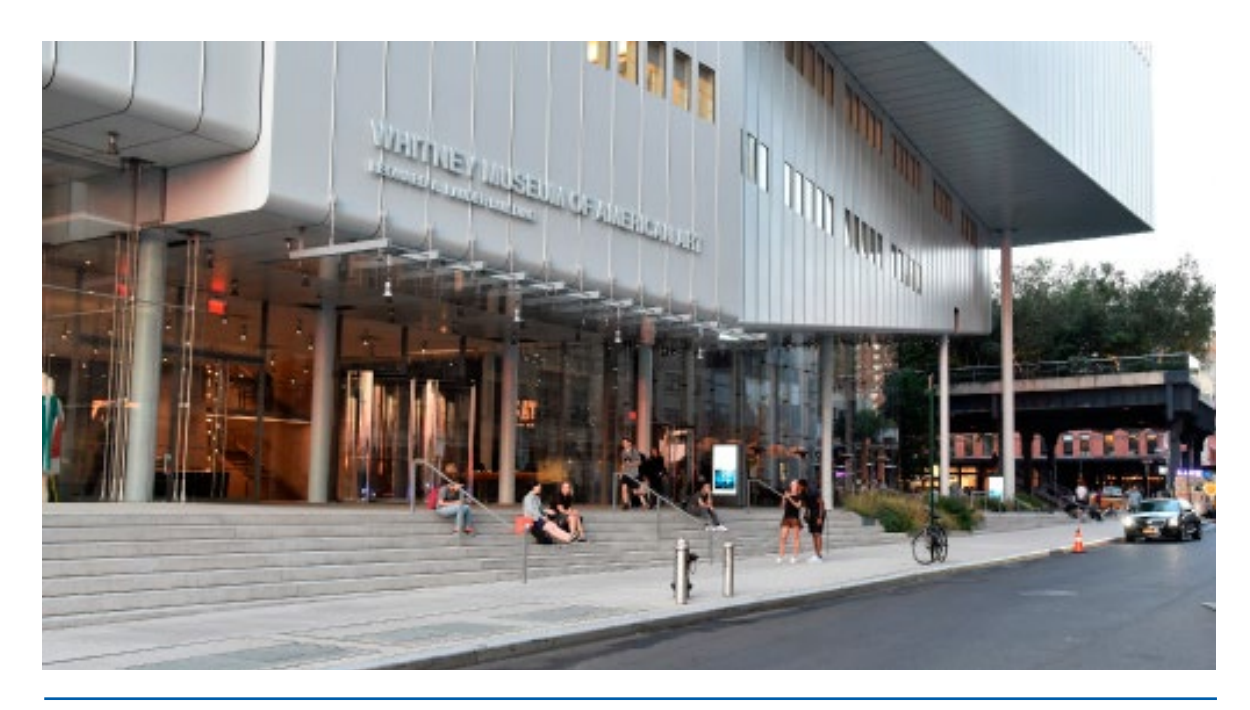
8. Main entrance to the museum, on the right the High Line Park