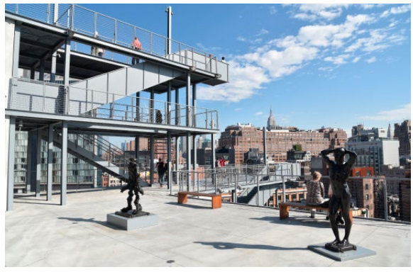
10. Outer staircases and terraces are used by the public as the main way of communication between museum galleries