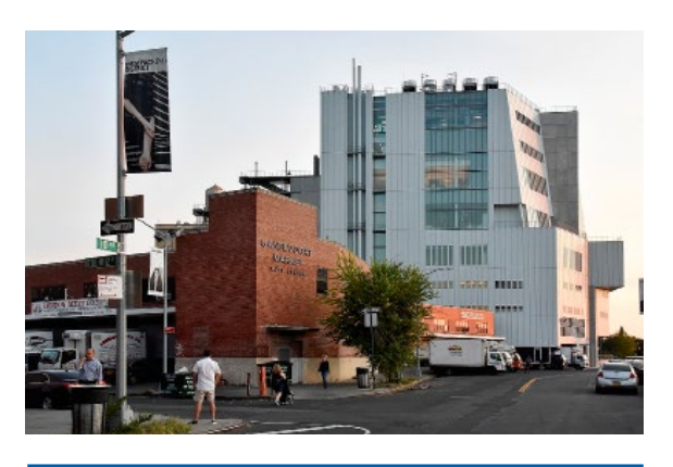
9. New building of the Whitney Museum seen from the north, in the foreground the meat wholesale Gansevoort Market