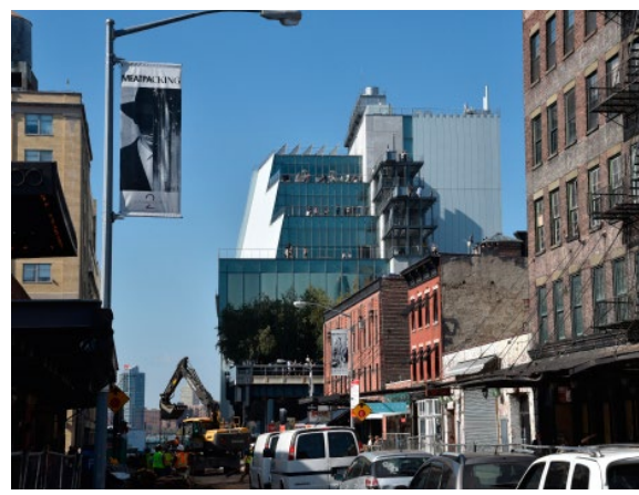
7. New building of the Whitney Museum seen from the east, along Gansevoort Street