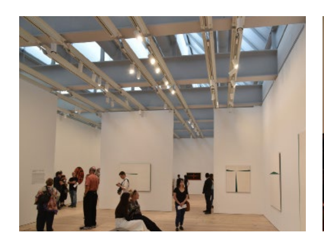
11. Daylighted gallery at the highest level of the museum building