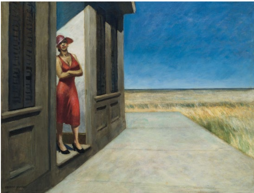
14. Edward Hopper, South Carolina Morning , 1955, Whitney Museum of American Art, http://collection.whitney.org/object/789