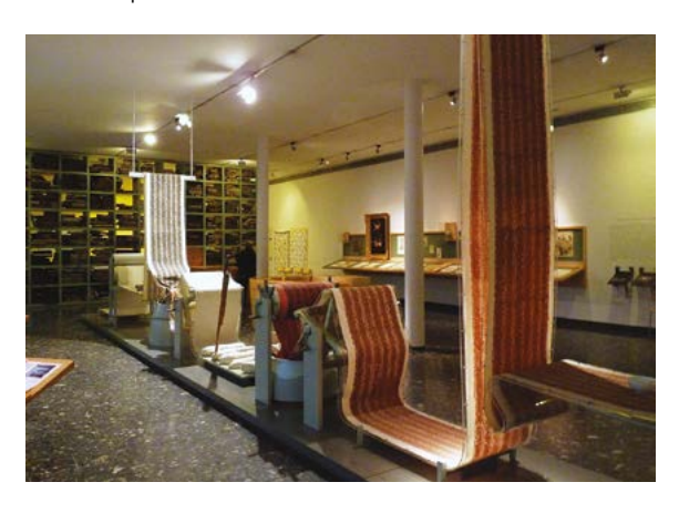
8. One of the display rooms of the Musée de l'Impression sur Etoffes, printing patterns on fabrics, Mulhouse