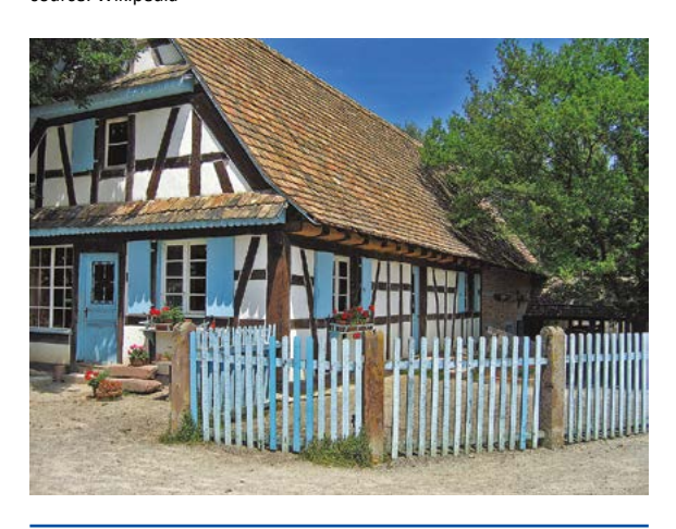
3. An Alsation house at the Ecomusée de l'Alsace, Ungersheim