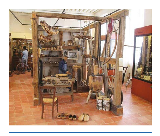
4. Ecomusée de la Bresse Bourguignonne, Pierre-de-Bresse