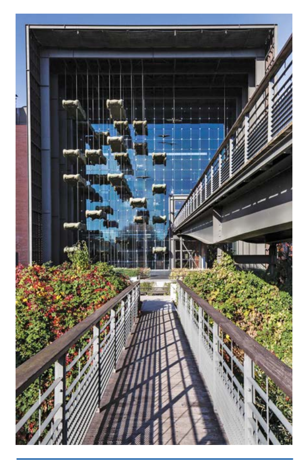
5. Cité de l'Automobile, Mulhouse; source: Wikipedia