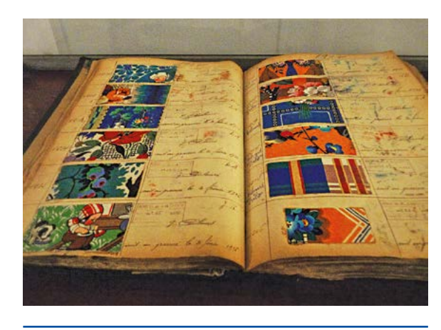
9. Books with drawings of patterns for dyeing fabrics, Musée de l'Impression sur Etoffes, Mulhouse