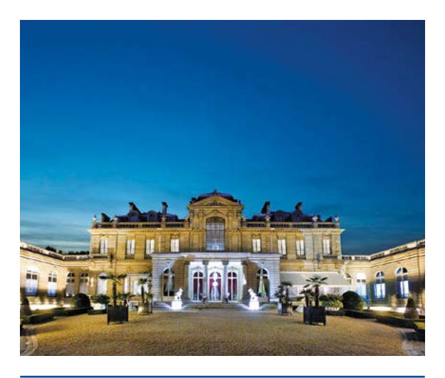
11. Jacquemart-André Museum, Paris