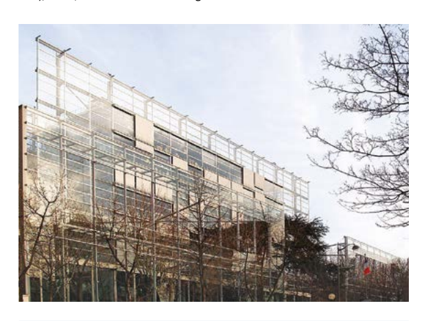
15. Jean Nouvel, glass and metal structure of the Fondation Cartier pour l'Art Contemporain, Paris

Les Républicains submitted a bill meant to protect their future and introducing the legal concept of musée privé de France (private museum of France), which would guarantee private museums the same economic legal and social privileges that musées de France enjoy. Will the creative eye perish in the struggle with the museum mainstream, namely public and private museums? Will economy turn out to be more important than emotions? The future will show.