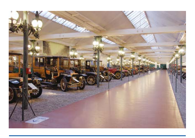
6. Cité de l'Automobile, Schlumpf Collection, Mulhouse

The Cité de l'Automobile was founded in 1981 on the grounds of the collections of Fritz Schlumpf, a textile industrialist passionate about car racing. Threatened with dispersion following the collapse of the family HKC company and the collector's forced migration to Switzerland, the collections were purchased, together with the mill building, by the purpose-established Association du Musée National de l'Automobile, formed e.g. by the City of Mulhouse, Council of the Haut-Rhin Department, Panhard Society, and the Automobile Club de France. Boasting 25.000 sq m of display