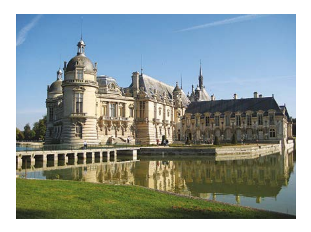
10. Chantilly Castle: Musée Condé