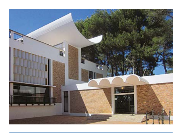
13. José Louis Sert, architecture of the Maeght Foundation in Saint-Paul-de-Vence

François Pinault, whose 'empire' includes, e.g. grands magazins (department stores): Le Printemps, La Redoute, Fnac, but also Christie's, collector and frère ennemi (enemy brother) of Bernard Arnault, is in the course of preparing a new Paris seat for his collection-museum, in the very centre of the city, close to the Louvre, in the building of the Paris Stock Exchange.44 The adaptation of the historic building to serve the purposes of a modern art centre: Bourse de Commerce - Collection Pinault, has been tackled by Tadao Ando, the most famous Japanese architect, author of e.g. the Hyôgo Prefectural Museum of Art in Japan's Kobe and the Modern Art Museum in Fort Worth, USA. 45 This new tendency does not apply exclusively to Paris. The Hôtel de Caumont in Aix-en-Provence, property of Culturespace, opened in 2015, only during the first year of its activity was visited by over 300.000 people interested in the new form of artistic performances combining visual arts and music. It seems that museum institutions of the new type are driving smaller private museums away from the cultural space. On behalf of the latter, on 13 June 2018, Jean-Charles Taugourdeau together with a group of deputies from the Party