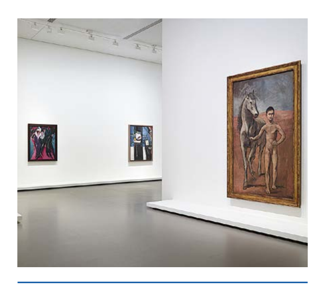
16. Exhibition 'Etre moderne: Le MoMA à Paris. Being modern: MoMA in Paris', Fondation Louis Vuitton, Paris; source: Fondation LV

(Fot. 1 – Moktarama, CC BY 3.0; 2 – paris 17, CC BY-SA 2.0; 3 – J.-P. Daniel, Domaine public; 4 – Arnaud 25, CC BY-SA 4.0; 5 – Culturespaces/C.Recoura, CC BY-SA 3.0; 6 – Dontpanic, CC BY-SA 3.0; 7 – Arnaud 25, CC BY-SA 3.0; 8, 9 – Ji-Elle, CC BY-SA 3.0; 10 – G. Cattiaux, CCBY-SA 2.0; 11, 12 – Ch. Recoura, CCBY-SA 3.0; 13 – Waterborough, CC BY-SA 3.0; 14, 16 – M. Domage; 15 – R. Ornelas, CC BY 2.0)