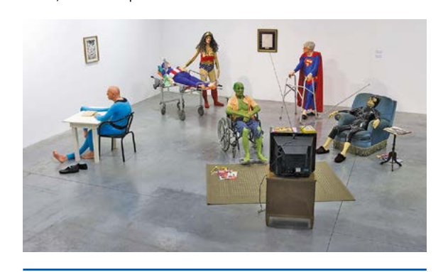
14. Gilles Barbier, L'hospice, 2002, la Maison Rouge Fondation Antoine de Galbert, Paris, Exhibition 'Vraoum! Trésors de la bande dessinée et art contemporain' ('Vraoum! Treasures of the Comic Strip and Contemporary Art'), 2009